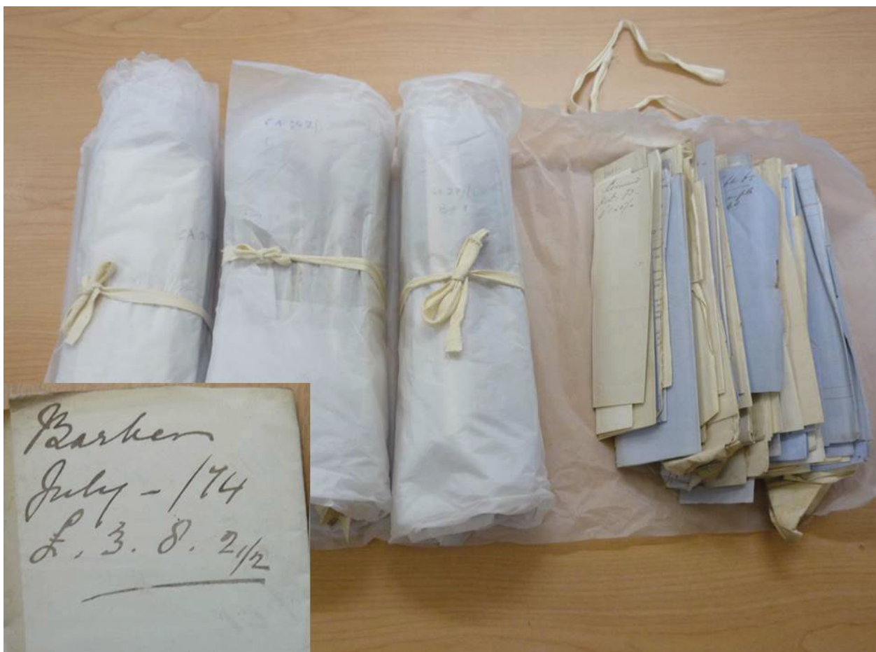
Fig. 4 Hector's 'Personal Domestic Accounts' held in Te Papa archives (Te Papa CA000294), consisting of four bundles of folded bills. Each of the bills is neatly labelled on the outside in James Hector's handwriting (inset, lower left).