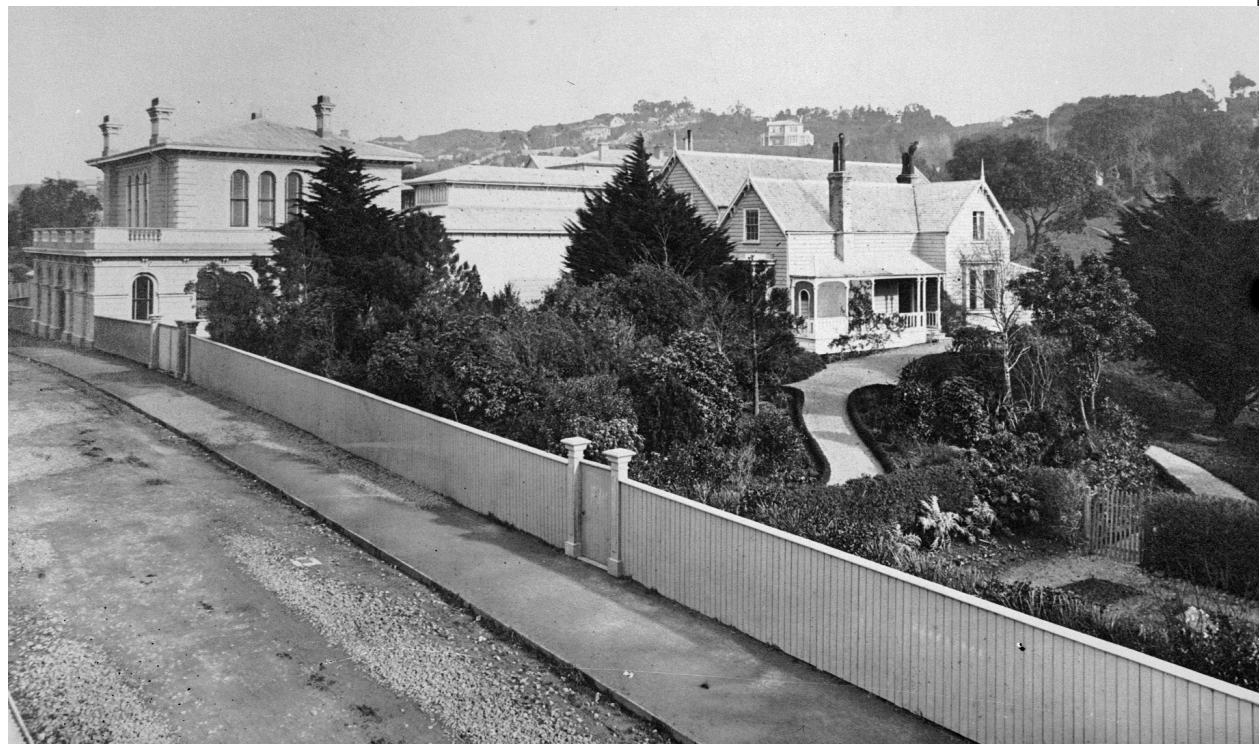
Fig. 2 ( above ) Museum House (centre right), with the Colonial Museum behind, photographed in 1868. Museum Street is on the left, with Sydney Street in the foreground. This photograph was taken soon after Hector had rented the house, but before he had altered and extended it.