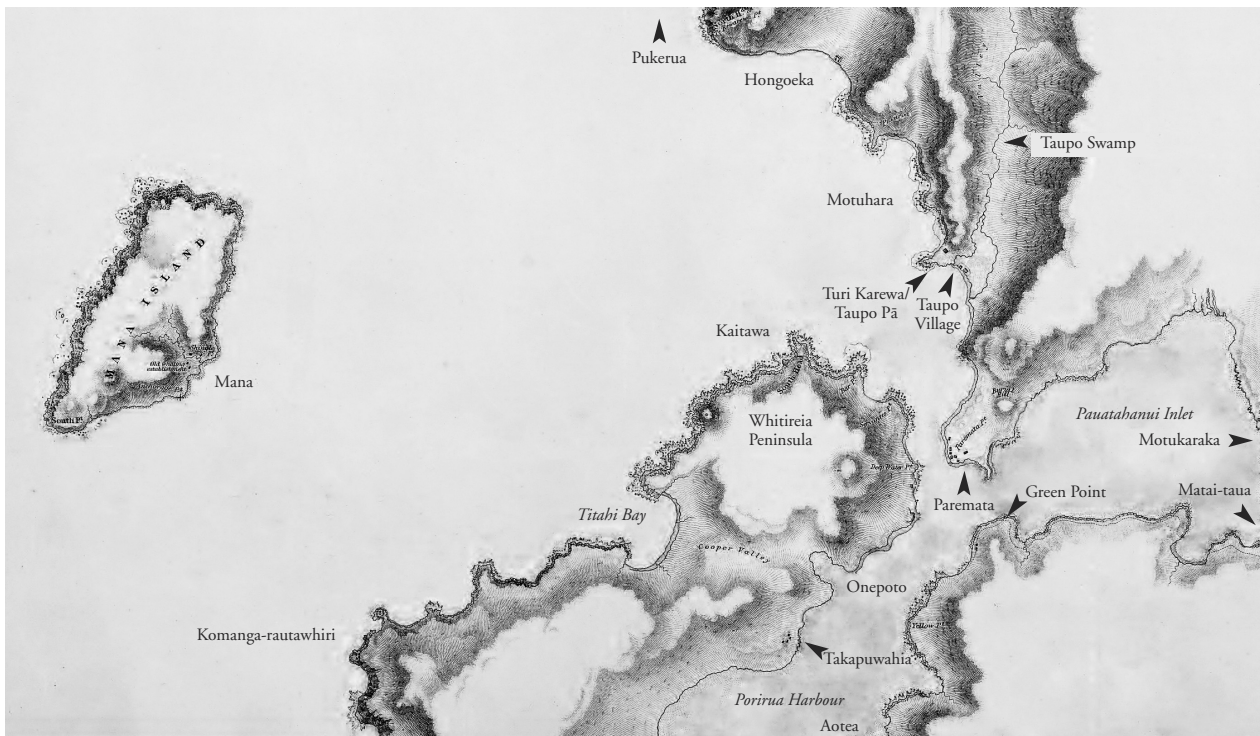
Fig. 4 Map of pā and kāinga discussed (after HMS Acheron 1850).

chief Tungia. An account by Watene Taungatara says that the pā was taken only after a false offer of a truce was made (Taungatara 1899: 7), a tale further elaborated on by Smith (1910: 303) and recorded by the Māori Land Court: ‘The land was obtained by the conquest by Te Rauparaha and Tuwhare and it was taken possession of by Te Pehi hanging a garment (he Kaka) on a post on the land’ (Māori Land Court 1892: 368).