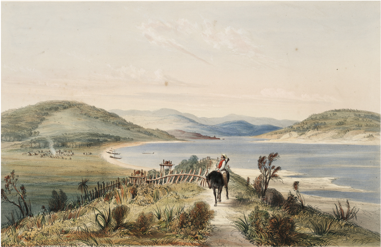
Fig. 5 Porirua Harbour and Parramatta whaling station in Nov.r 1843, 1843 , hand-coloured lithograph. Artist Samuel Brees (PUBL-0011-12, Alexander Turnbull Library, Wellington).

least initially, unfortified. In Fig. 5, Taupo Village, illustrated in 1843 by Samuel Brees, is shown as a kāinga. The wāhi tapu where Te Hiko would later be buried is in the foreground above the future pā of Turi Kawera. In the distance can be seen Paremata Whaling Station, alongside which Paremata Pā was sited. The scene in Fig. 6 was drawn by George Angas French two years after Brees' image of the same settlement (and printed in 1847). By then Taupo was clearly palisaded, the fortifications probably added as the result of tension following the Wairau Affray in 1843 (Stodart 2002: 25).