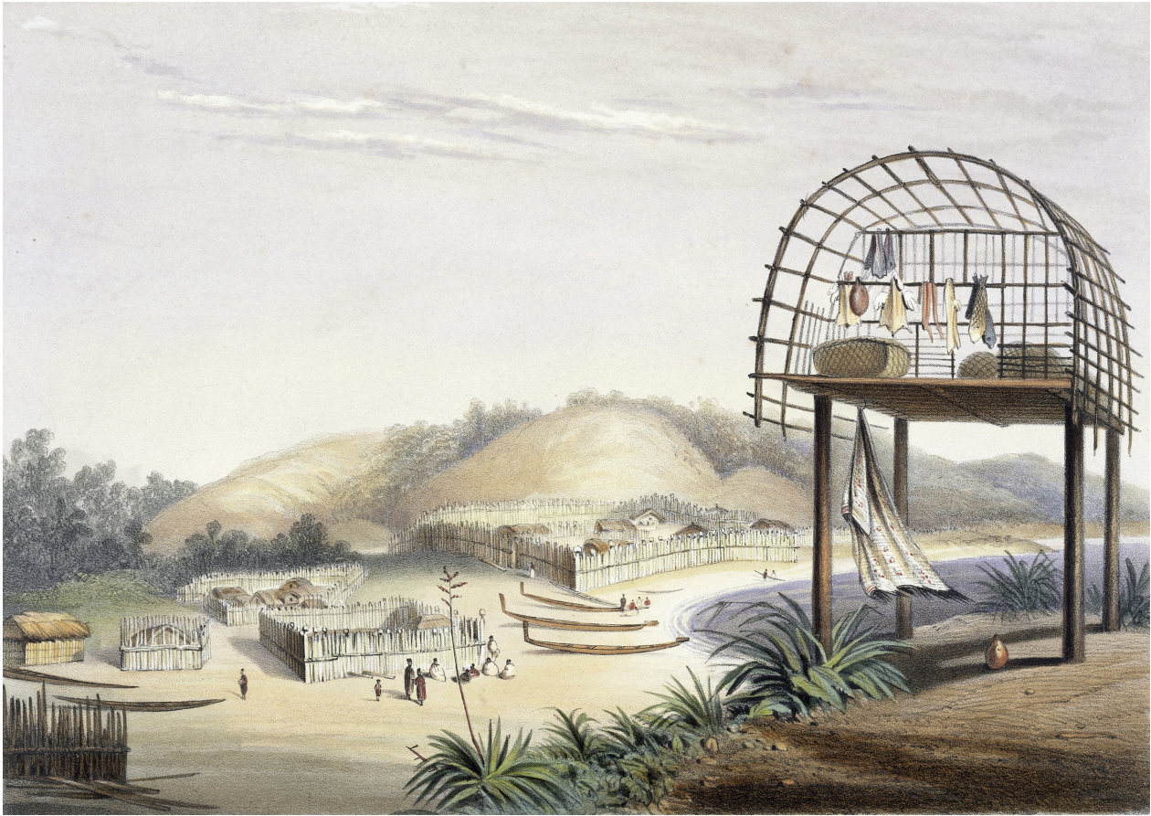
Fig. 6 Taupo Pa , 1847, hand-coloured lithograph. Artist George French Angas, lithographer J.W. Giles (PUBL-0014-48, Alexander Turnbull Library, Wellington).