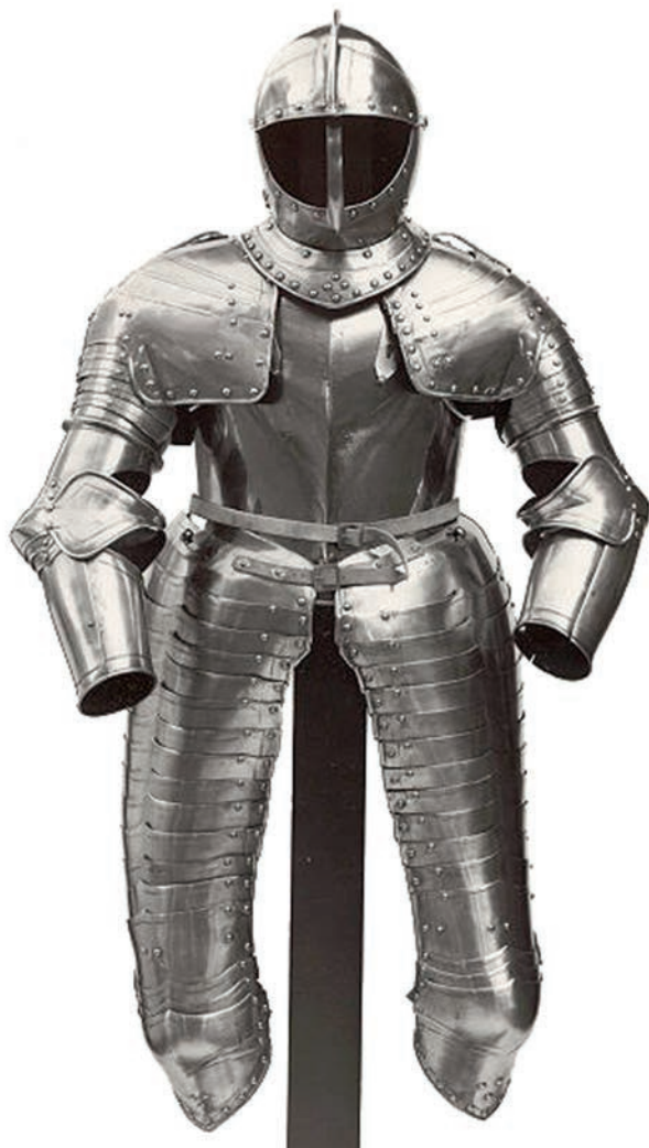
Fig. 3 A suit of cuirassier armour matching the general description of that supplied to Patuone and Titore, c.1630, made in the Netherlands (collection of the Royal Armouries, Tower of London, II.104,).