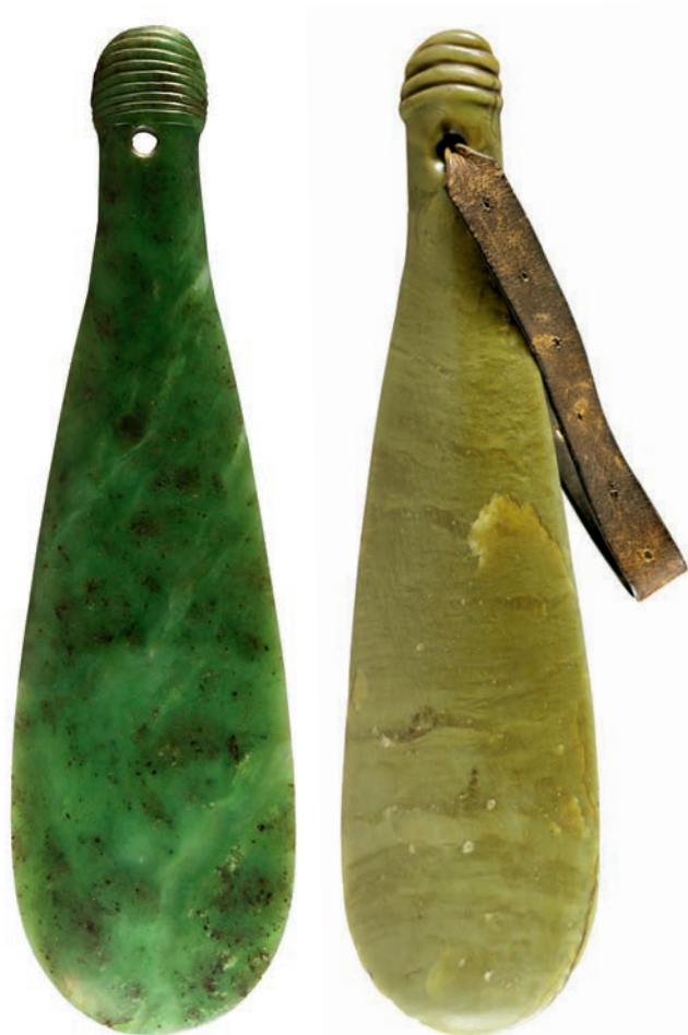
Fig. 5 Mere pounamu (greenstone clubs). Without documentation, the provenance of these two objects cannot be verified, but they are probably those given to William IV by Titore and Patuone (Royal Collection, St James's Palace; A, 62810; B, 62811).

cloaks as presentations, as they had been photographed with them on formal occasions, and such gifts were likely to have been stored safely. In the case of mere, which are relatively indestructible and made of a precious substance (nephrite), there was a good possibility that at least some of those presented to members of the royal family would have survived, especially if they were accompanied by historical documentation, such as registers. The case for the Titore mere was particularly interesting to me as the circumstances of its presentation and the clear evidence that it had been received was beyond question. What then, might have become of it?