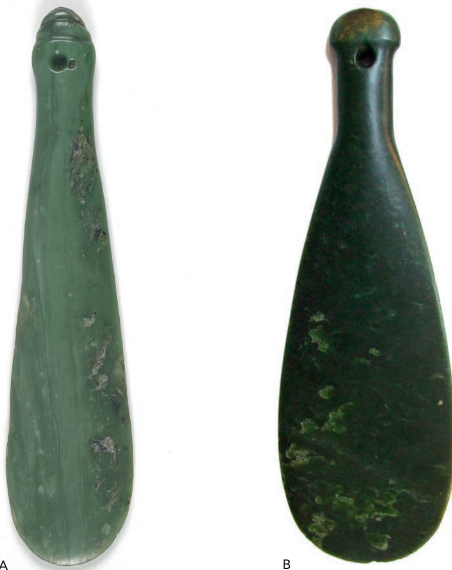
Fig. 6 Two mere pounamu (greenstone clubs) originally in the possession of Captain William Hobson. One of these was presented by Patuone on 6 February 1840 and intended for Queen Victoria. A, 'mere pounamu with three grooves on butt, pre-European drilled hole. Pale green, 15 inches, greatest width 3.5 inches' (Te Papa ME 010819); B, '19th century, dark green with paler flecks, with a fairly thin blade and a slight chip on the top edge, the butt without ridges and a bi-conical perforation' (Waitangi National Trust WNT1961/1/1; reproduced with permission).