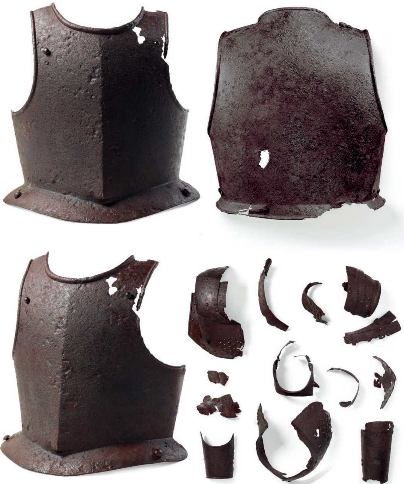
Fig. 2 Armour of Titore (Te Papa collection ME 001845).