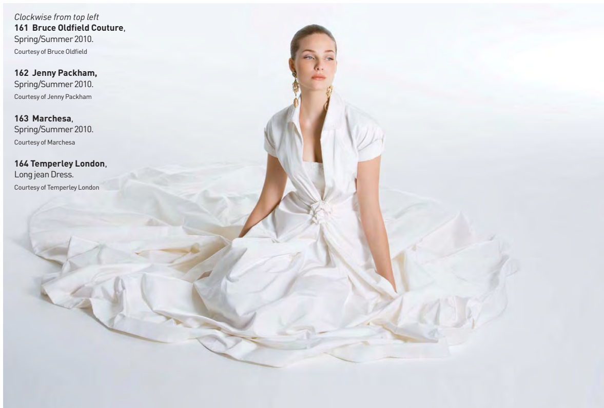
164 Temperley London, Long jean Dress.