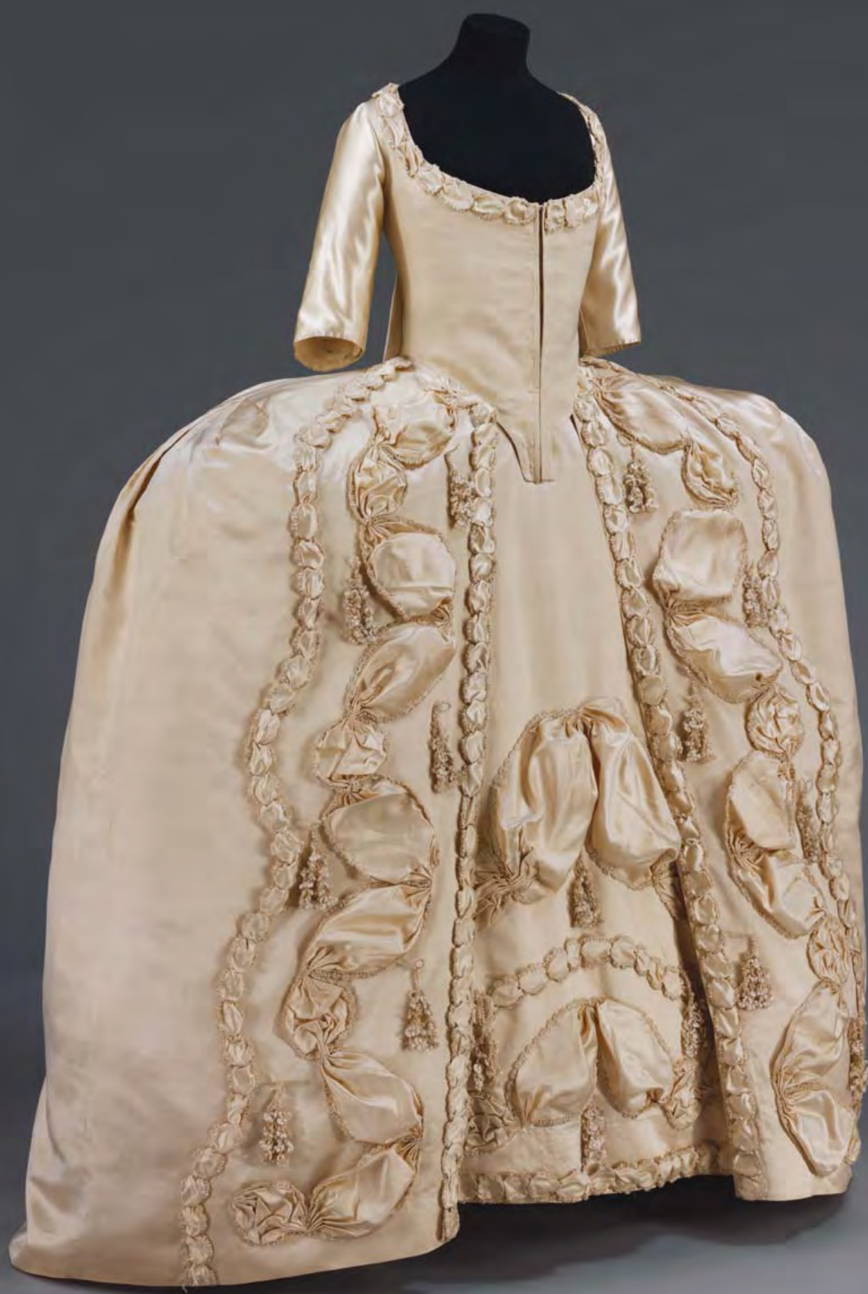
23 Silk satin court dress (front and back), British, 1775–80. This dress was associated by the donor with a wedding. It may have been worn for a very formal private evening ceremony but it is more likely that it was worn for the bride's presentation at court following her marriage. V&A: T.2&A-1947