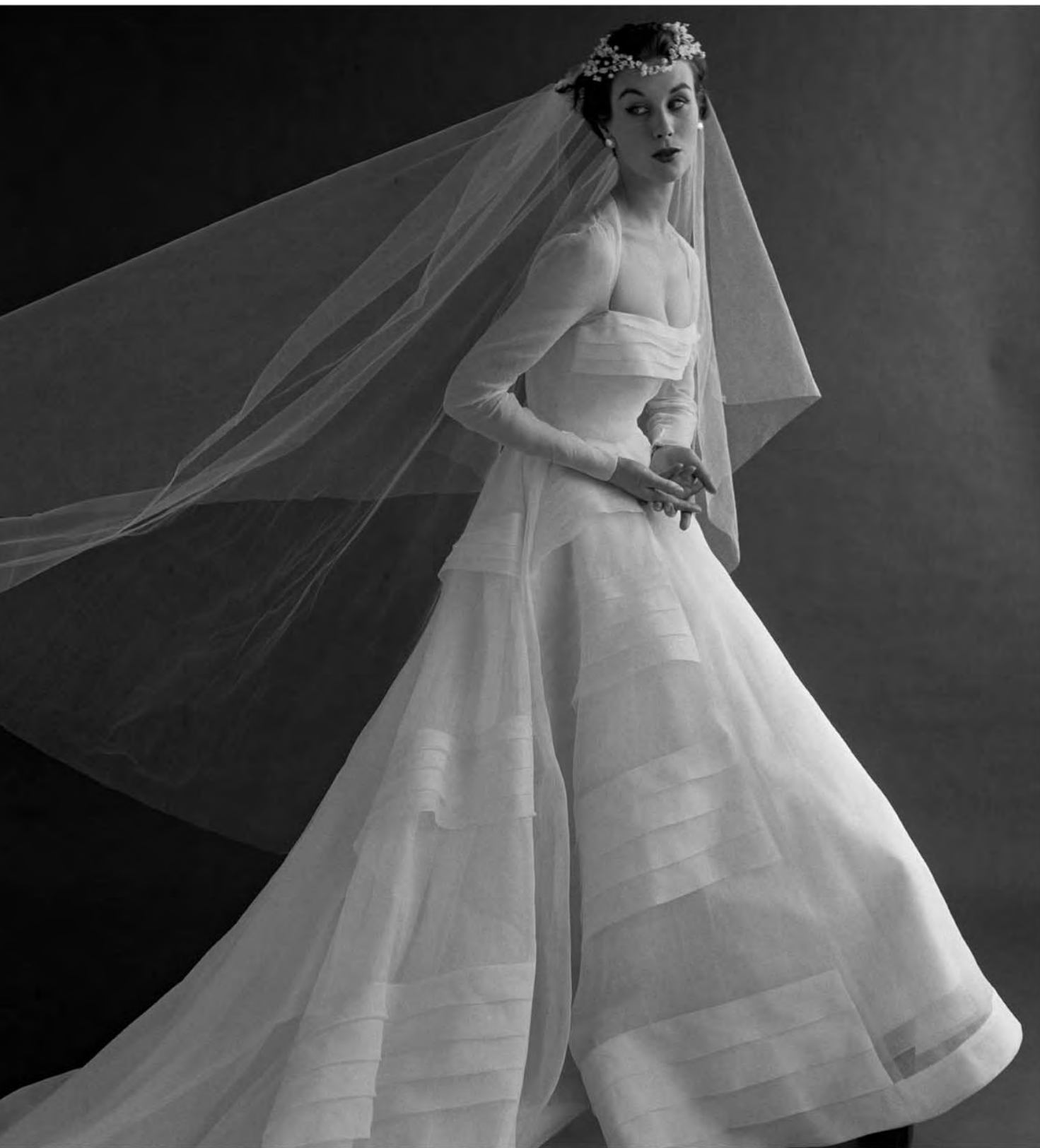
111 Cotton organdie wedding dress designed by Hardy Amies for the Cotton Board, 1953.