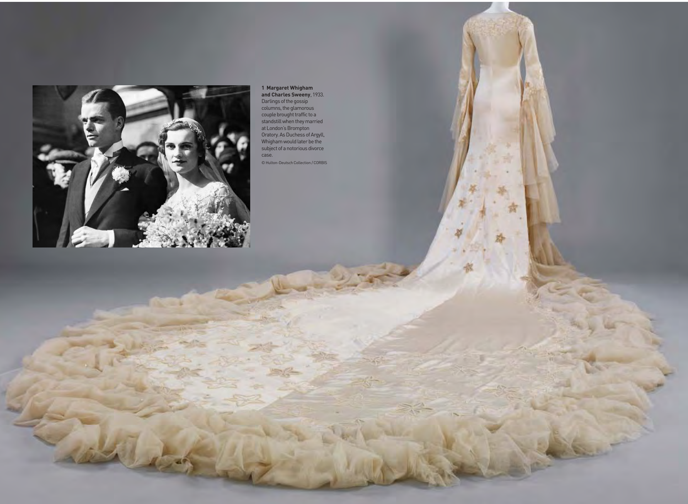
2 Silk satin wedding dress (front and back) by Norman Hartnell, London, 1933. Margaret Whigham commissioned the dress from the celebrated couturier for her marriage to Charles Sweeney on 21 February 1933. V&A: T.836-1974. Given and worn by Margaret, Duchess of Argyll