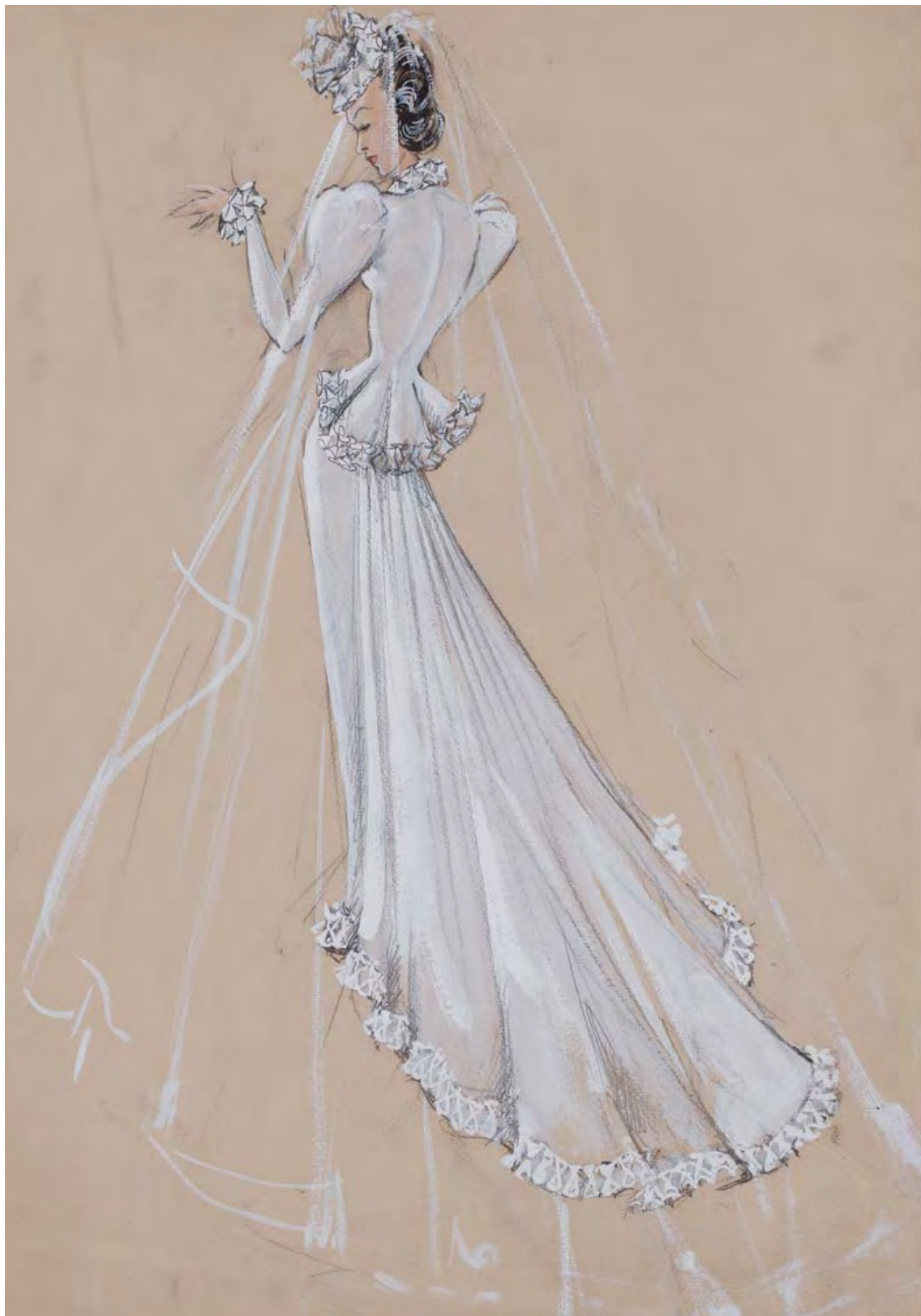
99 Sketch of a wedding dress by the House of Paquin, pencil, ink and body colour, London, 1939–40. The design captures the theatricality of the 1930s.

V&A: E.22922–1957. Given by the House of Worth