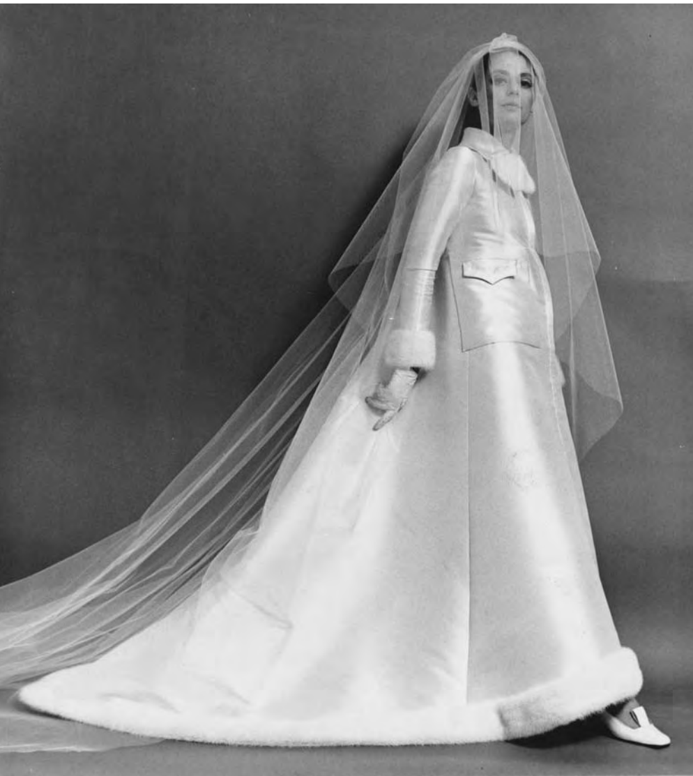
120 Ziberline wedding coat-dress by Jean Patou, with shoes by Andrea for Patou, Paris, 1967. London College of Fashion. The Woolmark Company