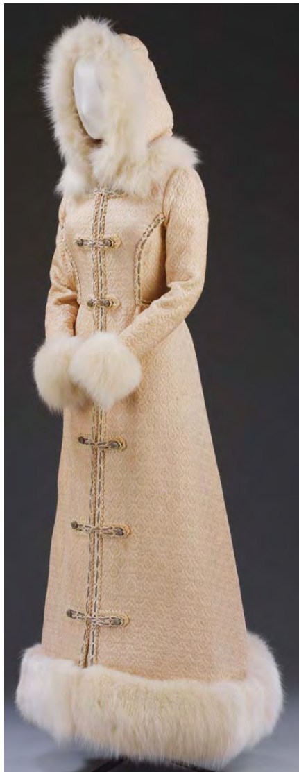
121 Silk and fox fur wedding coat by Bellville et Cie, London, 1968. The coat reflects the new fashion for maxi-coats. A fur-trimmed coat worn by Julie Christie as Lara in David Lean's popular film Dr Zhivago (1965) inspired its design. V&A: T.82-1988.