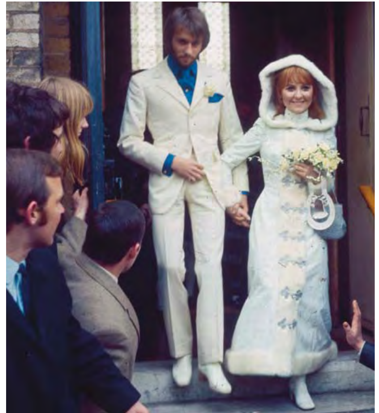
122 Lulu and Maurice Gibb 18 February 1969. Lulu's wedding coat was trimmed with mink.