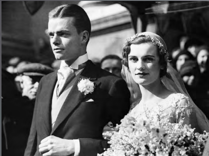
1 Margaret Whigham and Charles Sweeney, 1933. Darlings of the gossip columns, the glamorous couple brought traffic to a standstill when they married at London's Brompton Oratory. As Duchess of Argyll, Whigham would later be the subject of a notorious divorce case.