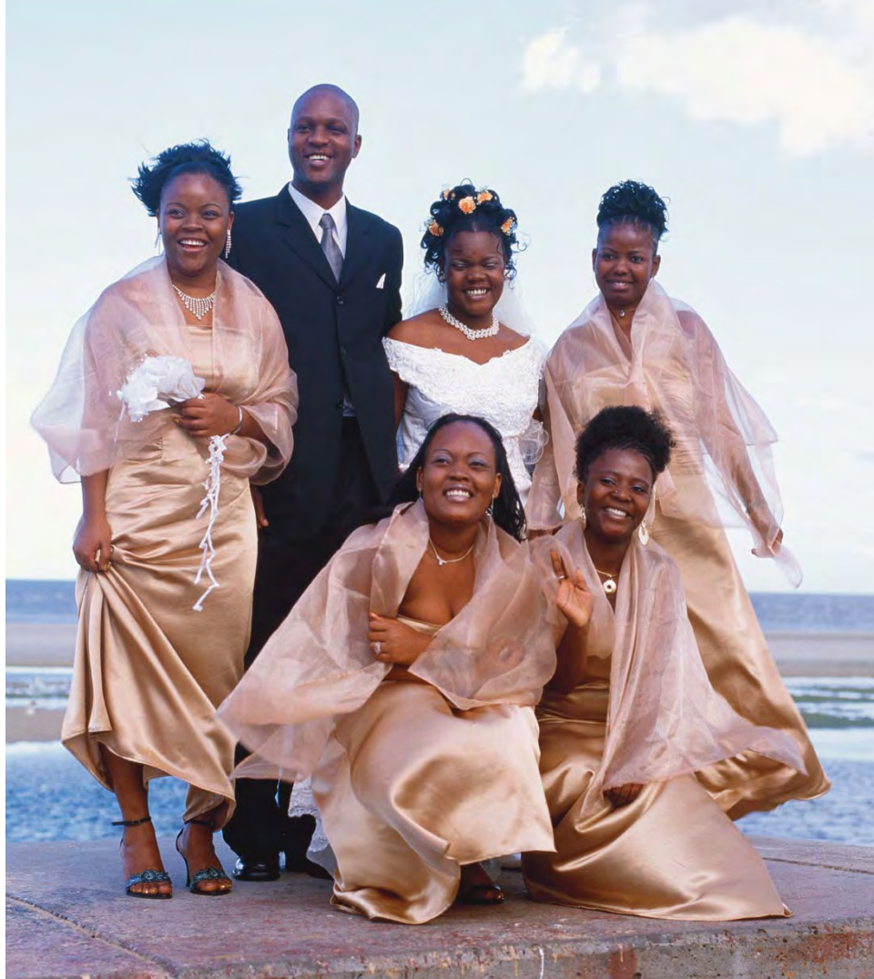
10 African wedding in Costa do Sol, Maputo, Mozambique, 2004. The spread of Christianity has encouraged many African brides to wear white wedding dresses.