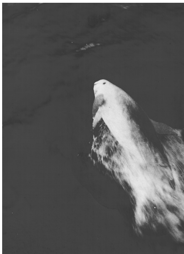
Fig. 1 Pelorus Jack (a Risso's dolphin, Grampus griseus) accompanies a vessel in Admiralty Bay, 1901–09.