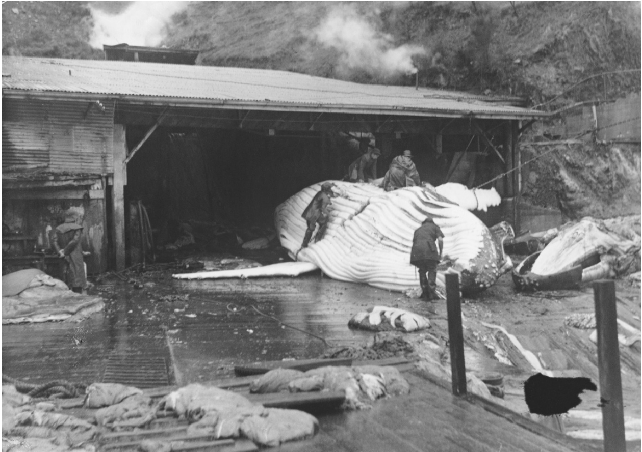
Fig. 4 A humpback whale ( Megaptera novaeangliae ) being processed at Perano whaling station, Fishing Bay, Tory Channel, c. July 1948.

taking of humpback whales within 3 nautical miles (5.6 km) of the New Zealand coast.