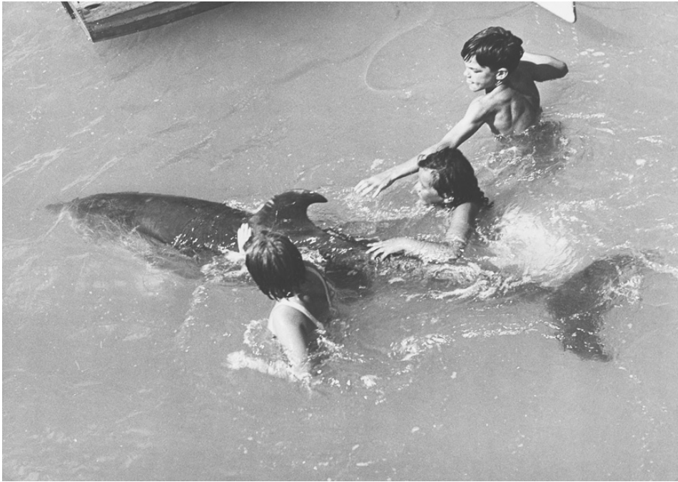
Fig. 2 Children playing with Opo (a bottlenose dolphin, Tursiops truncatus), Opononi, 1956.