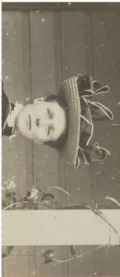
Woman in hat. From the album: Snapshot album - Nga Mahanga, circa 1900, Manawatu, maker unknown. Te Papa.