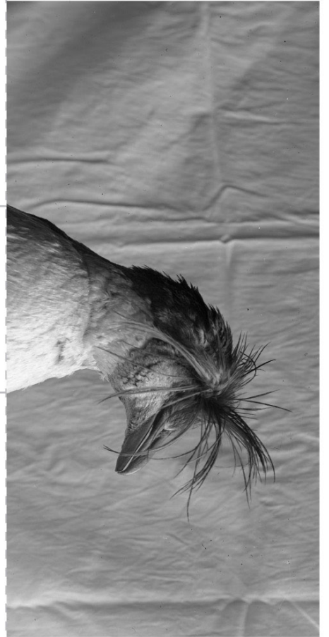
Bird, mounted penguin, circa 1908, New Zealand, Maker unknown.