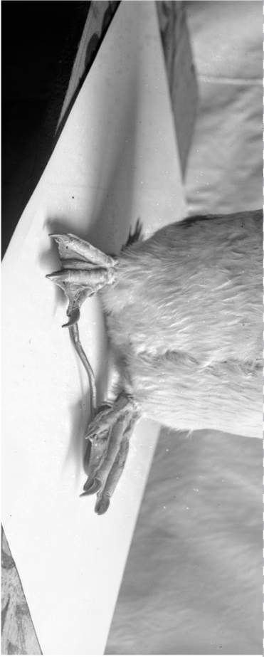
Bird, mounted penguin, circa 1908, New Zealand, maker unknown. Te Papa (B.043118)