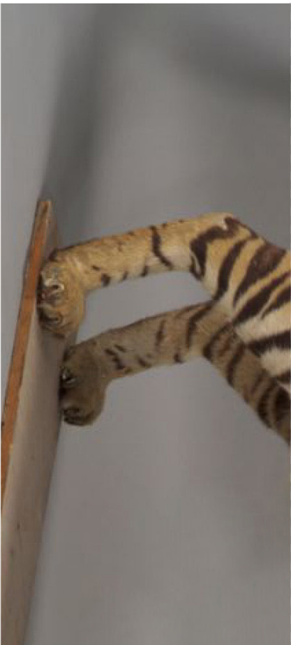
Tiger, Panthera tigris , collected no data.