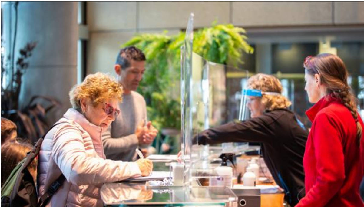
COVID-19 Te Papa reopening May 2020, 2020. Photo by Jo Moore. Te Papa (157978)