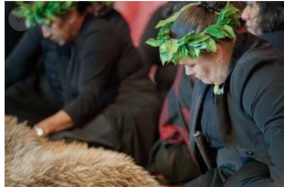
Repatriation Powhiri at Te Papa, 2018.

Te Papa was established with strong bicultural principles, manifested in the co-leadership model, the building design, the inclusion of a marae for all people, and continuing through our commitment to our iwi exhibition programme, and support for iwi in Treaty settlement processes. The repatriation of Māori and Moriori ancestors from overseas museums and university collections, achieved through the administration of the Karanga Aotearoa Repatriation Programme, is an important dimension of reconciliation and healing, restoring dignity and respect to our people.